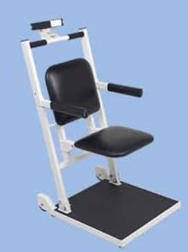
6876 Bariatric Stand-On/Chair Scale