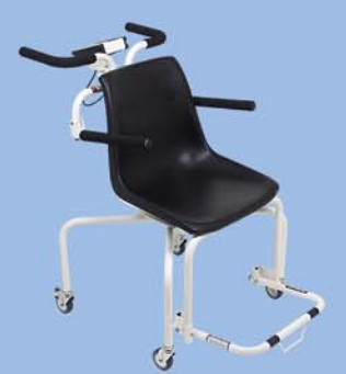
6880 Rolling Chair Scale