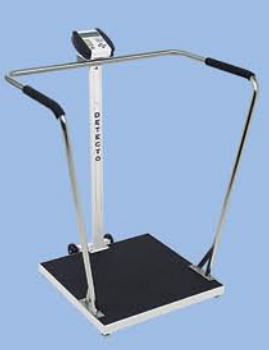
6856 Bariatric Scale