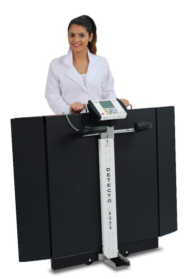
DO NOT DROP!