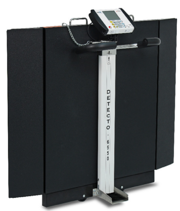
Correct Storage Position

9. For storage, use column release to release column and fold down to locked position. Replace storage pin (see warning label on scale base). Store in an up-right position, preferably near a wall for maximum protection against damage.