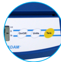
Simple three button operation