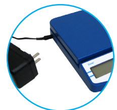
AC adapter included