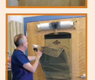
Rollboard Disposable Cover Dispenser, Part # 1088